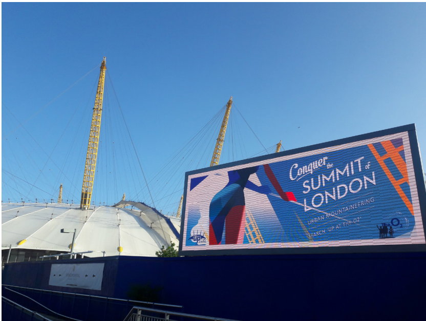
Figure 6.5: Up at the O2 – Greenwich Peninsula.

Providing spectacular descents is an obvious way that high rise structures can cater for tourists seeking thrilling experiences. In 2007 the artist Carsten Holler caused a stir in London with his Tate Modern exhibition featuring a series of slides which transported people from upper levels to the floor of the Turbine Hall. This exhibition was called Test Site and Holler felt that his structures were prototypes for slides that could be introduced as permanent features of London’s cityscape. Nine years later, this futuristic vision came a step closer when a slide he designed was installed on the Arcelor Mittal Orbit. The Orbit is a sculpture which was designed by the sculptor Anish Kapoor to provide London’s Olympic Park with the iconic structure that Boris Johnson (Mayor of London 2008–2016) felt it lacked. An observation deck and lift had already been installed near the top to encourage people to ascend, but when The Orbit opened to the public visitor numbers were disappointing. Rather than closing the attraction, officials decided to reinvent it by adding an experiential