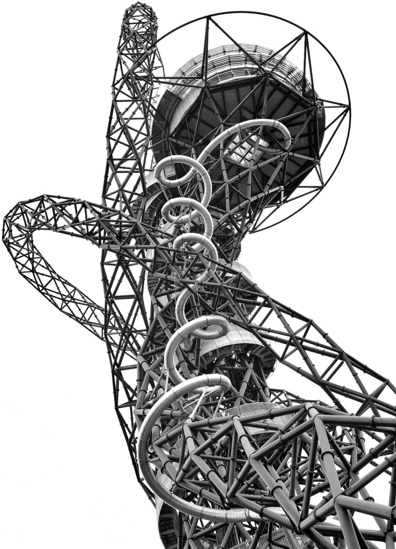
Figure 6.6: The Ancestral Mittal Orbit featuring a New Slide.