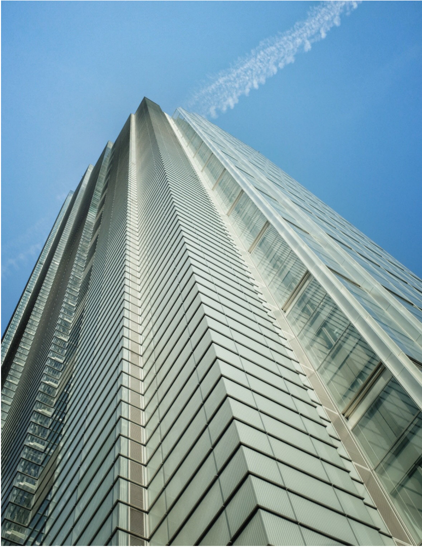
Figure 6.7: 110 Bishopsgate – Formerly Heron Tower, now called the Salesforce Tower.

Go Ape followed this trend by opening their first city centre site in London's Battersea Park. This company installs ladders, ropes, platforms and zip wires in trees creating an elevated playground. Go Ape in Battersea Park caused a lot of controversy because it meant an expensive attraction was installed in a public park. When a similar attraction opened in Glasgow, the urbanist Ronan Paddison (2010) was one of the people who campaigned against it – arguing that Go