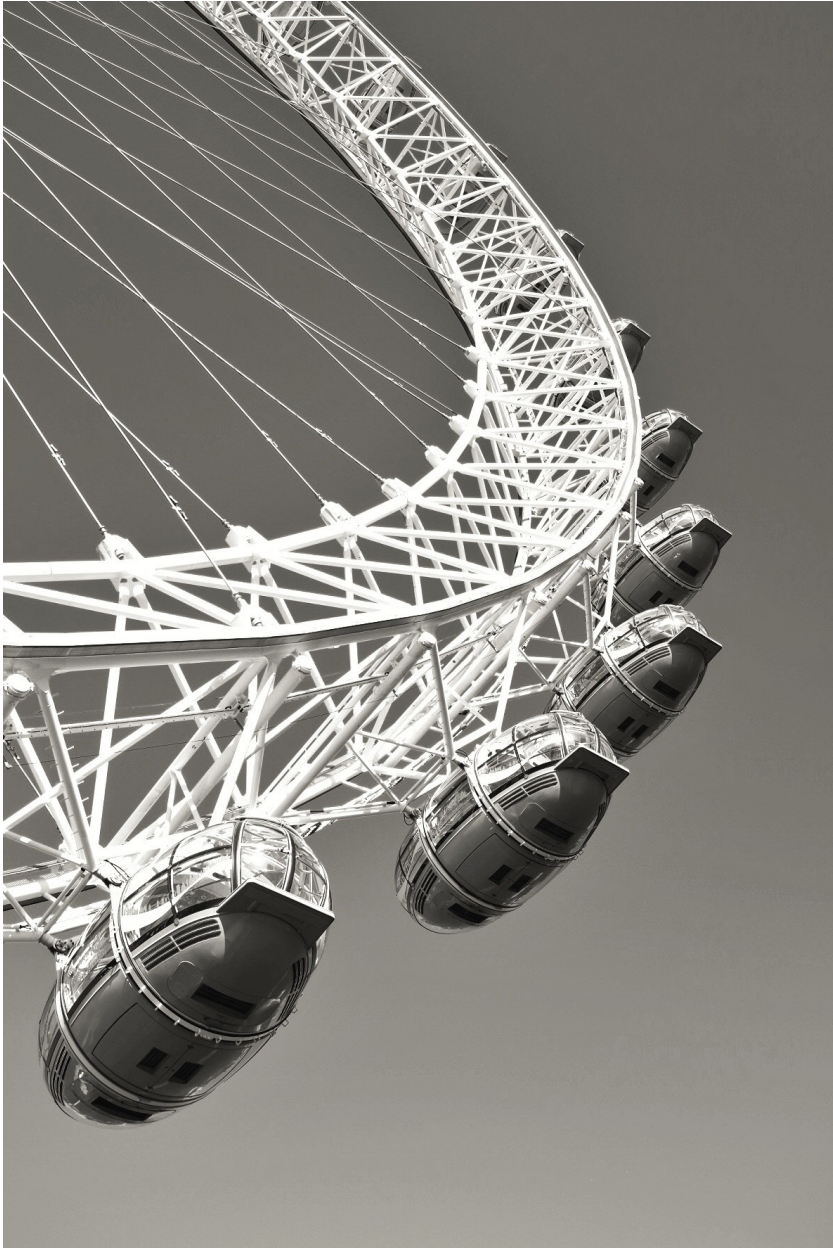
Figure 6.3: The London Eye.