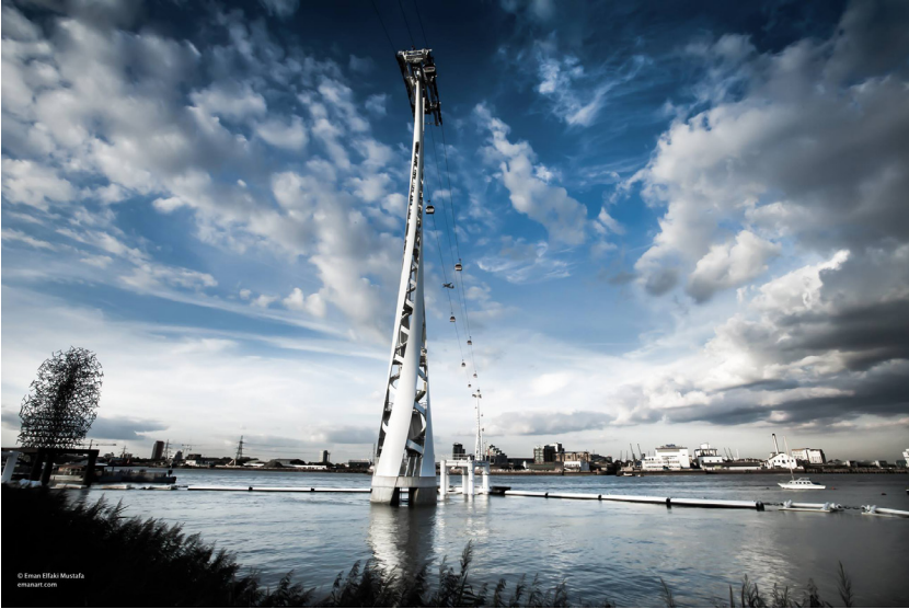
Figure 6.4: The Emirates Air Line – London’s New Aerial River Crossing.

and offices via helicopters and never touching the ground seems like a dystopic vision from a J.G. Ballard novel, but it is already a reality in some South American cities (Graham and Hewitt 2012; Harris 2015).