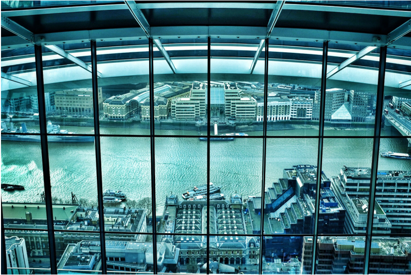
Figure 6.2: The View from the SkyGarden – 20 Fenchurch Street.

the reputation of high rise buildings as exclusive territories. A viewing platform is clearly tourist terrain, but by eating in a restaurant or drinking champagne in a bar visitors get a chance to mix with city professionals and sample the ‘high life’ enjoyed by urban elites.