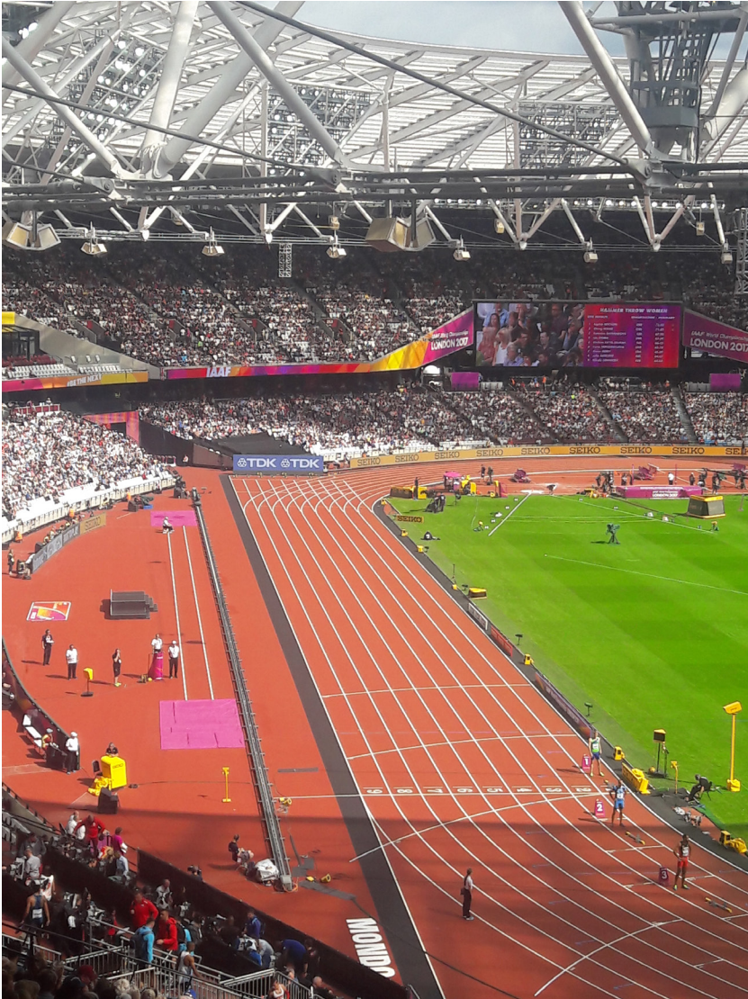
Figure 5.5: The London Stadium in Athletics Mode.

While the Olympic Park hosts tours of the Aquatics Centre, Velodrome and London Stadium, it is the last of these that attracts the greatest demand. From the reviews it is clear that its Olympic history is still an important part of its appeal. Many Olympic cities mark anniversaries of the Games (Cashman 1999) and London is no exception, with the stadium hosting an athletics meeting every July. Consequently, annual TV coverage displaying the