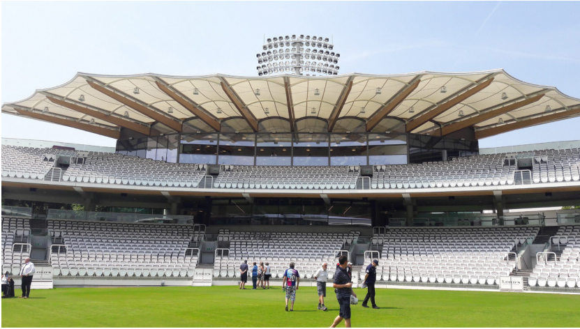
Figure 5.1: The New Warner Stand at Lord's Cricket Ground.

4.2 billion (Eurosport 2015). Consequently, many domestic and international tourists want to attend a live match or visit the stadium of EPL teams when they come to London.