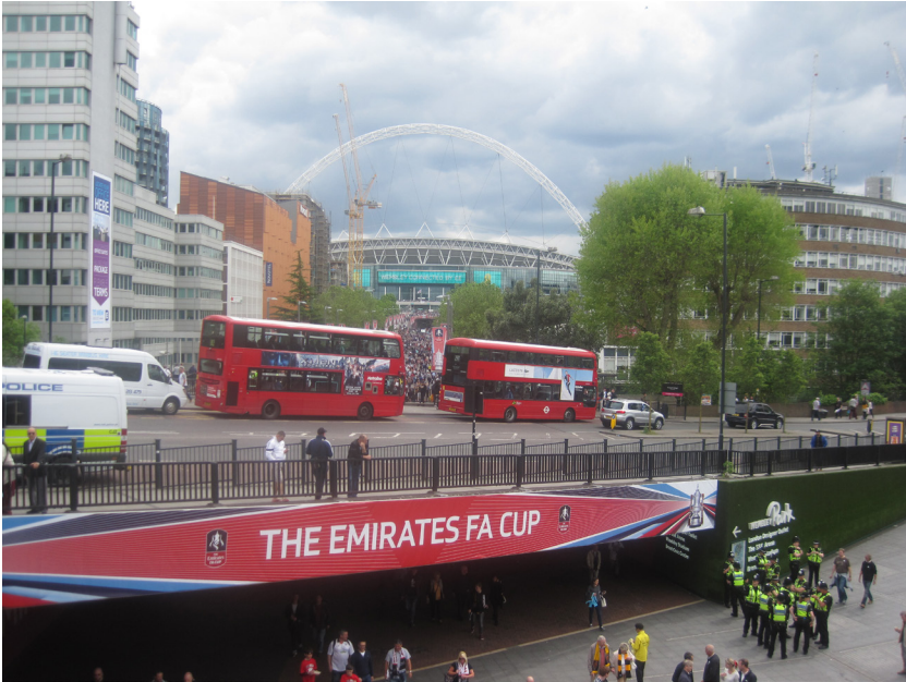
Figure 5.3: Wembley Stadium on FA Cup Final Weekend.

The lack of a home ground has not put paid to Tottenham Hotspur stadium tours, with specialist ‘Spurs at Wembley’ tours offered on the days adjacent to their home matches. Furthermore, the importance of serving the visitor market is revealed as the club has already announced that tours will be available at the new stadium when completed. The new stadium has been designed to incorporate a permanent visitor centre, housing a museum and Hall of Fame.