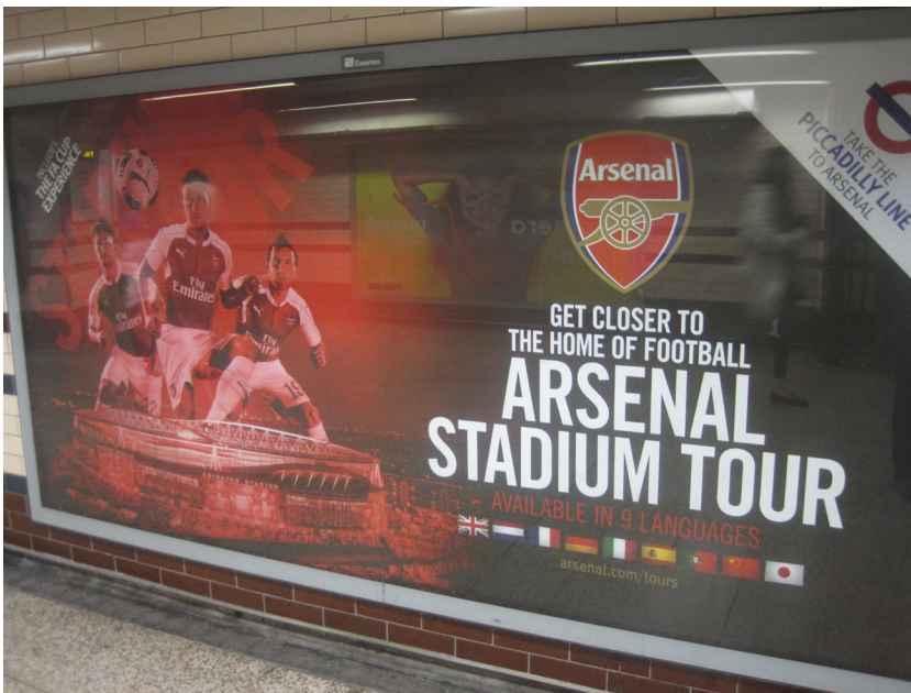
Figure 5.2: Poster on the London Underground Advertising Tours of Arsenal Football Club.